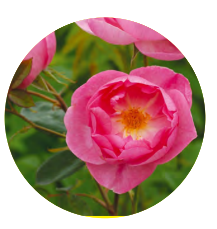
Carefree Beauty Rose Rosa 'Carefree Beauty'