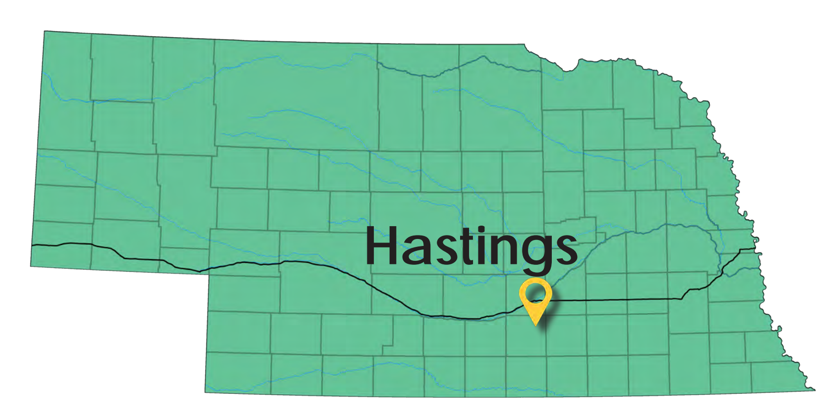
1218 North Hastings Avenue, Hastings, Nebraska