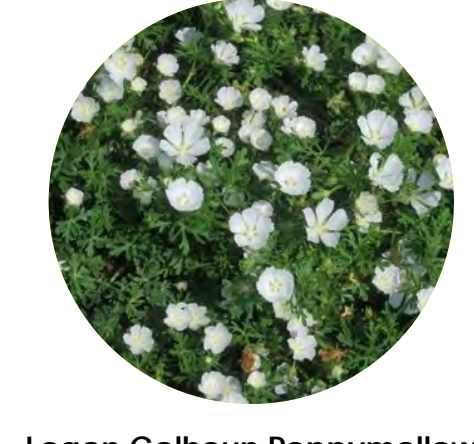
Logan Calhoun Poppymallow Callirhoe involucrata