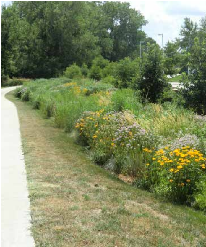
Runoff had been a serious problem at FireWorks Restaurant in southeast Lincoln. A rain garden, planted in 2009, prevents problems associated with standing water and makes the nearby trail more appealing.

more controlled or managed landscape, you may have to remove or relocate rogue plants. Doing research in advance will help you select plants that can be more easily managed and that best suit your garden aesthetic and management plan.