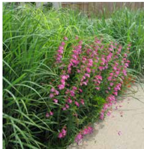
Plantings in downtown Scottsbluff filter and absorb runoff, soften reflected light and heat, and beautify the area year-round.