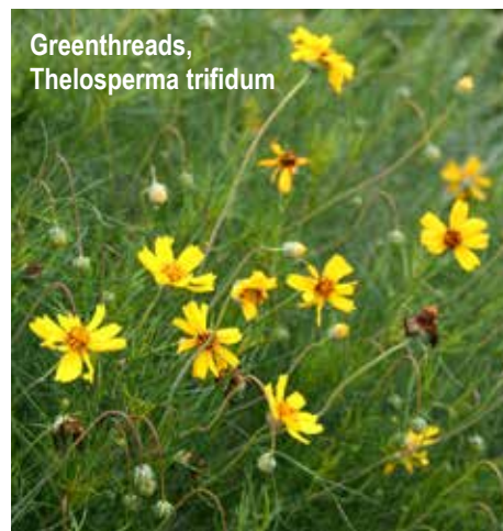
Greenthreads, Thelesperma trifidum

Medicinal Plants of the Prairie: An Ethnobotanical Guide , Kelly Kindscher