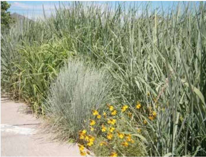
ABOVE: Little bluestem and Ratibida in front of a mixture of big bluestem, Indiangrass and switchgrass. Prairie Splendor penstemon with prairie junegrass and sedges.

Compared to man’s crops of wheat or maize (in fields adjacent on virgin soil), fluctuations in temperature of both soil and air are much less in the prairie, humidity is consistently higher, and evaporation is decreased. The demands for water and light increase more gradually and are extended over a longer period of time. Less water is lost by run-off or by surface evaporation. When drought comes, the vegetation gradually adjusts itself to the time of stress. Growth decreases, less water is needed, many species do not bloom, and the landscape temporarily takes on a dry appearance, which is again replaced by the fresher one of green upon the advent of rain.” J.E. Weaver