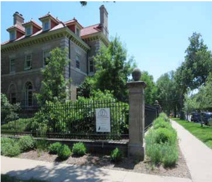
Above and below: The Ferguson House, at 700 S 16th St. in Lincoln, is home to the Nebraska Environmental Trust. The landscape surrounding the building is home to a wide variety of native plants and serves as a model of sustainable landscaping.