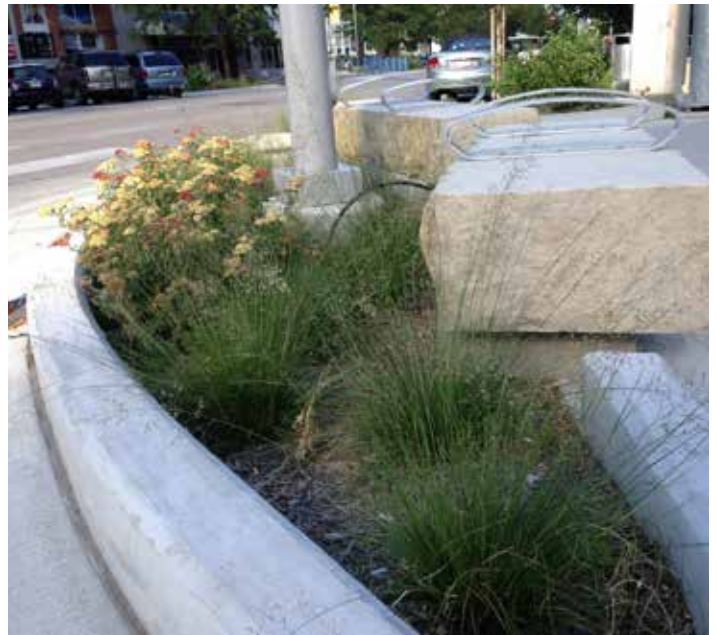
Small curbside plantings in downtown Lincoln make a big difference, both visually and in managing runoff from hardscaping.

While prairie plants have the obvious benefits of being adapted to the location, attractive to native wildlife and pollinators and more likely to survive heat, cold, flooding and drought, planting them does not create true prairie. Humans have been modifying this region's landscape since the 1400s. Historically fires, both natural and prescribed, have helped control, eradicate and propagate plant life but they are not practical or possible for most landscapes. The impact of native animals—from bison to prairie dogs—has also been greatly reduced, another change in the function, aesthetics and health of the prairie. Regardless of the limitations or restrictions that exist in today's world, there are ways to bring prairie back into our landscapes.