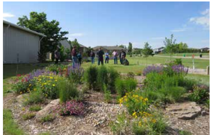
A newly-installed rain garden at the South Platte Natural Resources District in Sidney absorbs runoff, withstands hot, dry winds and offers visitors ideas for their home landscapes.

established. Spring-blooming prairie plants installed in the spring, like pasque flower or Baptisia , may be disappointing while growth is occurring below ground. Fall-blooming plants like asters and goldenrods installed in the spring often provide a nice display even the first year because they are allowed a season to grow. Instant gratification will not occur with prairie plants so remind yourself that gardens—most gardens—need three years or more to really come into their own.