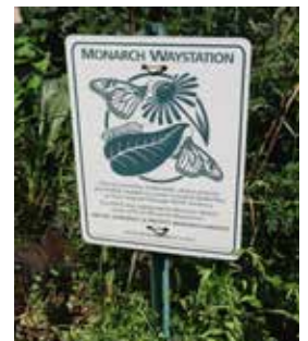
Three photos above: This property in northeast Lincoln is a designated Pollinator Habitat and a Monarch Waystation. Though it is a small yard, it offers an abundance of food, nectar and habitat for pollinators.

year initiative is to improve the biodiversity and ecological health of targeted community landscapes via greater use of native plants that in turn attract a much wider variety of important wildlife, especially pollinators and other critical insects. In short we will work to convince Nebraskans that landscape conservation and environmental stewardship should begin in our own yards and neighborhoods.