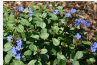
Plumbago—tolerates shade & sun; fills in without being a “thug”; doesn't require cutting back or dividing