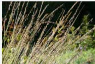
Sideoats grama—drought-tolerant; requires no maintenance & stays put