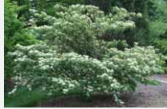
Pagoda dogwood—multi-season interest...flower, fruit, fall color, winter form