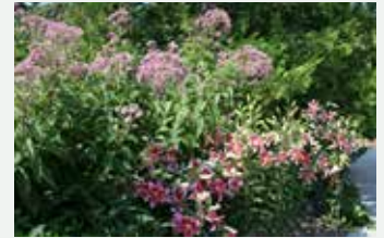
Joe-pye weed (for wetter areas)—easy, easy, easy; good as a filler plant