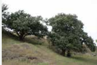
Bur oak—statuesque, hardy, long-lived tree