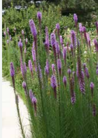
Gayfeather—tough as nails & long-lived; don't overwater