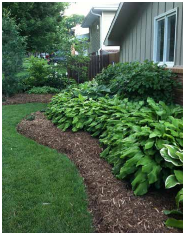
A simple v-edge cut into the lawn can separate lawn from perennial beds and allows for easy mowing.

There are seemingly endless edging options, but one of the best is simply to dig a shallow v-shape trench along the edge. It's the least expensive and allows for easy changes in bed size and shape. Plus you can mow right over the edge with no concerns for damage to the mower or edging. It