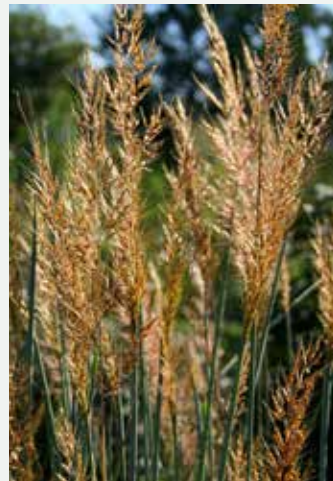
Indiangrass—for back of the border