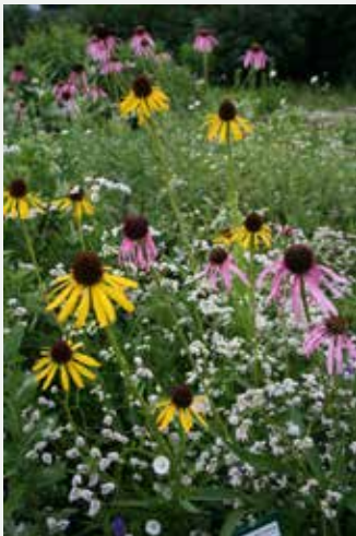
Coneflower—it grows; it flowers; looks great with grasses & fine without