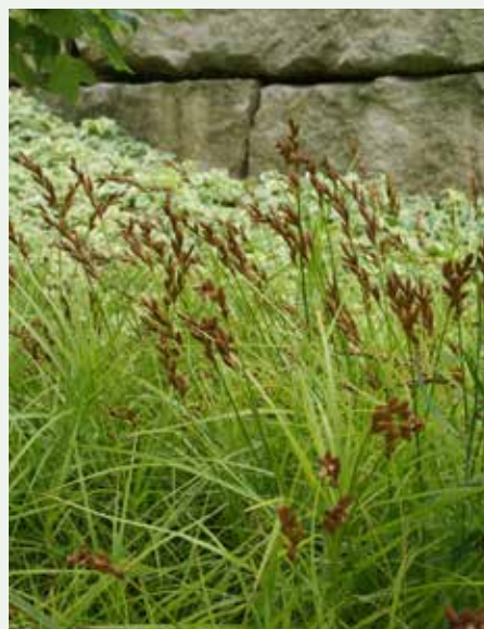
From top: variegated Solomon's seal; basket-of-gold; creeping Jacob's ladder; Carex muskingumensis .