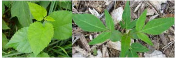
Identifying young woody plants like mulberry and tree-of-heaven is an important part of control.