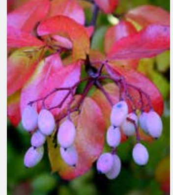
Viburnum—multi-season interest; love the fall color combinations of leaf & berry