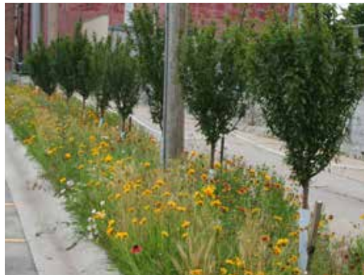
This woodland (top) and prairie garden were designed to encourage naturalization and allow for continual change.

been lost due to monoculture and disease. Large expanses of the same species may be beautiful but that simply does not make sense long-term. A diverse landscape is more resilient to pests, diseases and other environmental factors.