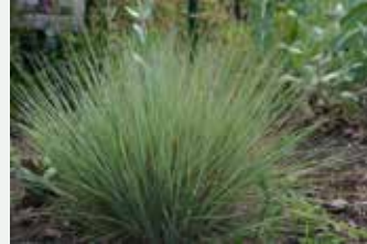
Little bluestem—great winter interest, drought-tolerant; can be cut back midsummer