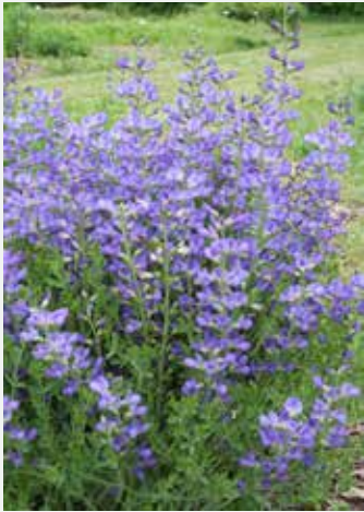
Blue false indigo—effective as a medium-size shrub

More at: pinterest.com/nearboretum/favorite-landscape-plants/