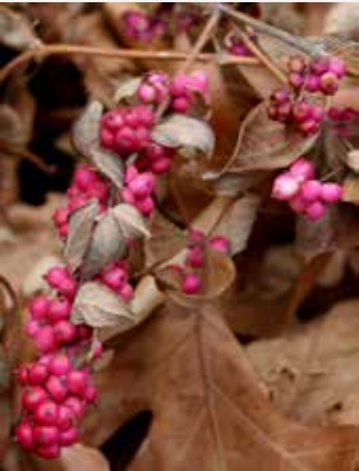
Chenault coralberry—great filler plant and wonderful for part-shade; easy to use in & around trees