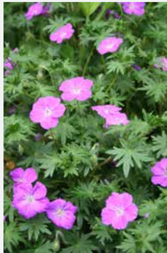
Geranium sanguineum—for part-shade