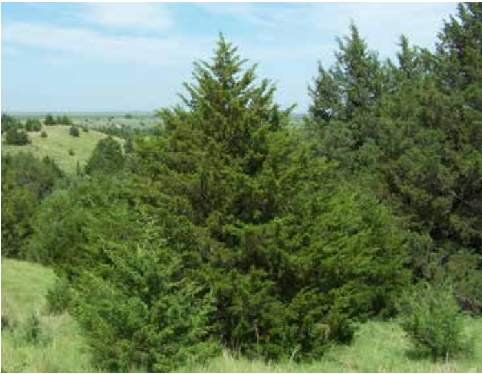
Photos of dandelion, white clover, common milkweed and eastern redcedar. All photos are from Nebraska Statewide Arboretum unless otherwise noted.

and/or aid biodiversity include things like pink smartweed, plantain, lambsquarters, pigweed, fleabane, goldenrod and aster, among others. Letting some of these plants grow here and there, even unintended, is not a bad thing. And it's a good excuse for being a bit lazy with the landscape. When the neighbors ask why you're not battling some of your weeds, just tell them you're doing your part for the environment. It's true!