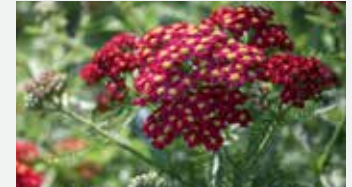
Yarrow—many to choose from; easy to grow