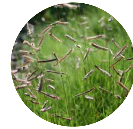
Blonde Ambition Grama Bouteloua gracilis