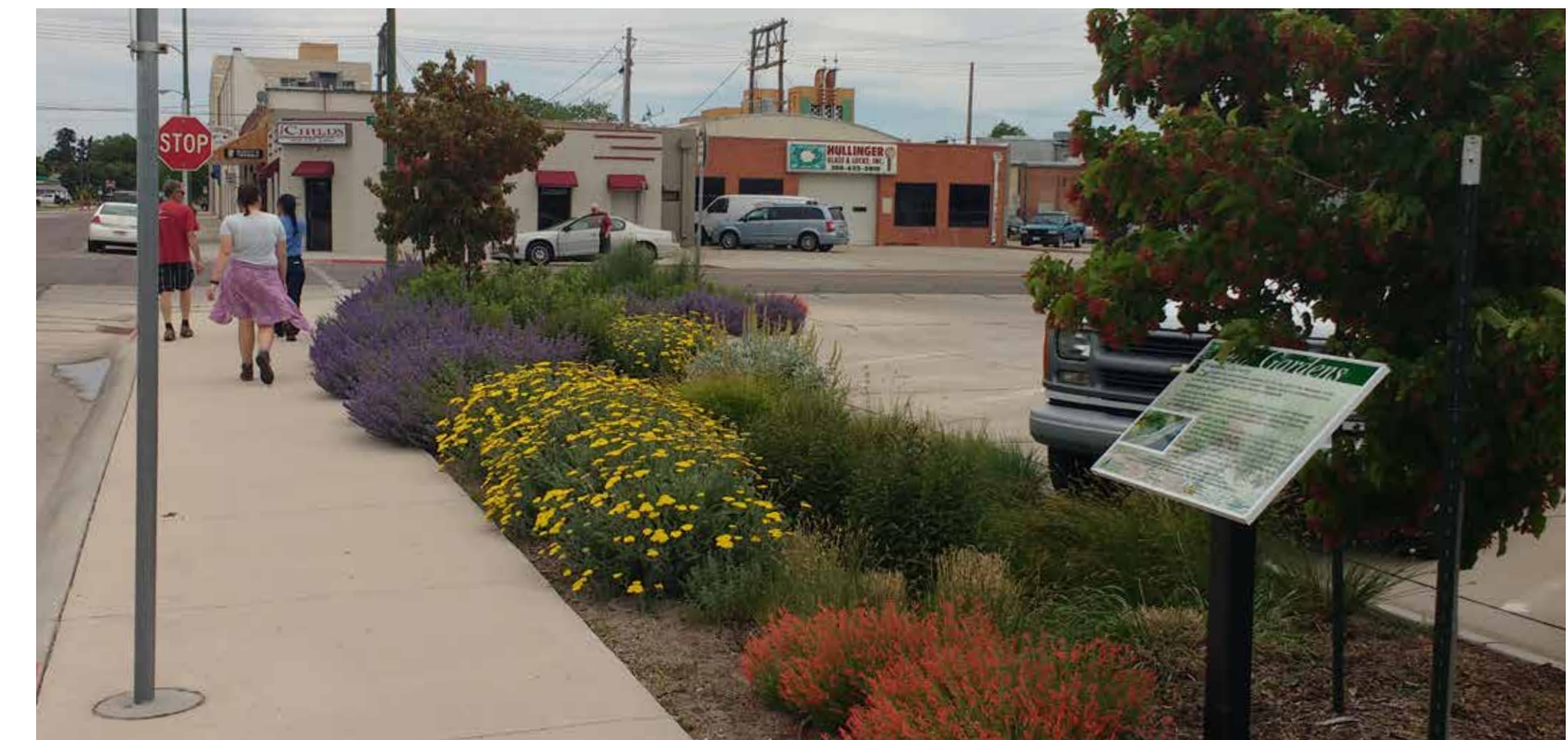
Scottsbluff started implementing a series of green infrastructure projects in 2009 to utilize the city's stormwater.

PAID BY GREENER TOWNS PAID BY OTHER GRANTS PAID LOCALLY DONATED TIME/GOODS PROJECT VALUE