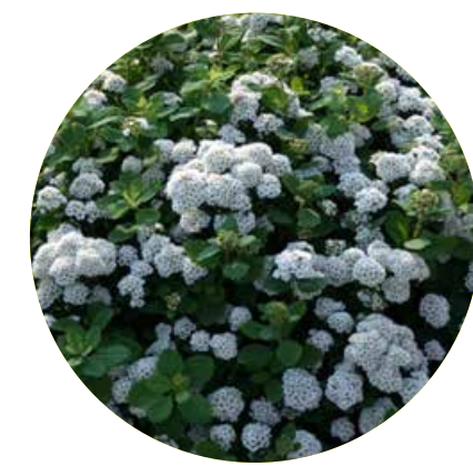
Tor Birchleaf Spirea Spiraea betulifolia