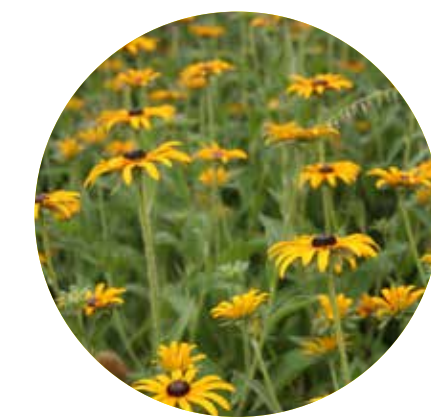
Goldsturm Black-eyed Susan Rudbeckia fulgida