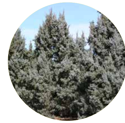
Woodward Juniper Juniperus scopulorum