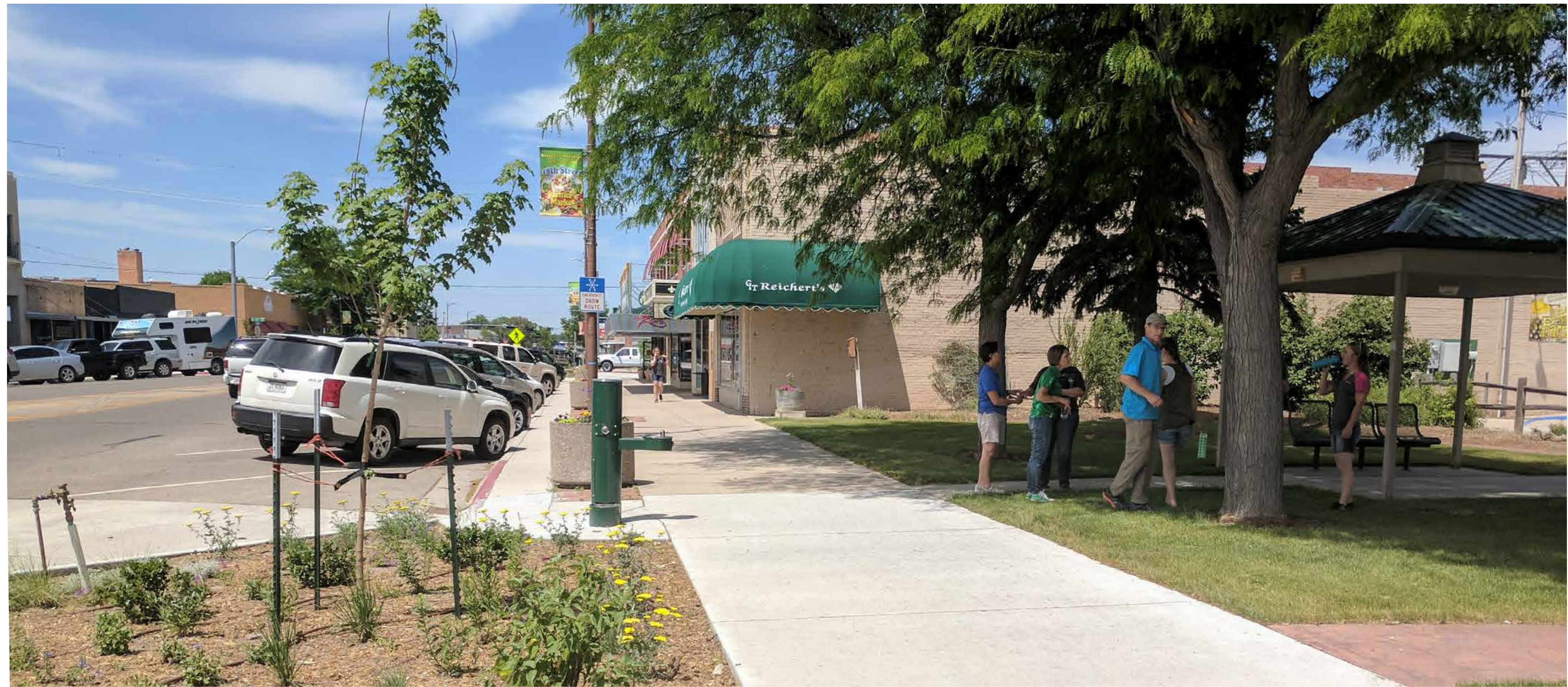
New trees and understory plantings will provide shade along Broadway Street in downtown Scottsbluff.

The City of Scottsbluff has been working diligently over the past few years to make Downtown a more sustainable environment. Located along Broadway, the focus of this project was a parking lot and two buildings removed to create a gathering space for events, with other planted areas further down the corridor. While it is the City's goal to create a comfortable space for people, it is equally important to showcase water conservation, stormwater management, and overall sustainability. The focus is on native and well-adapted plants that require minimal irrigation , and on proper soil management. Compost and wood mulch are used to add organic material and build the soil over time. Large shade trees will help cool the area and assist with carbon capture. Planting beds are large enough to give these trees plenty of rooting space for long-term success.