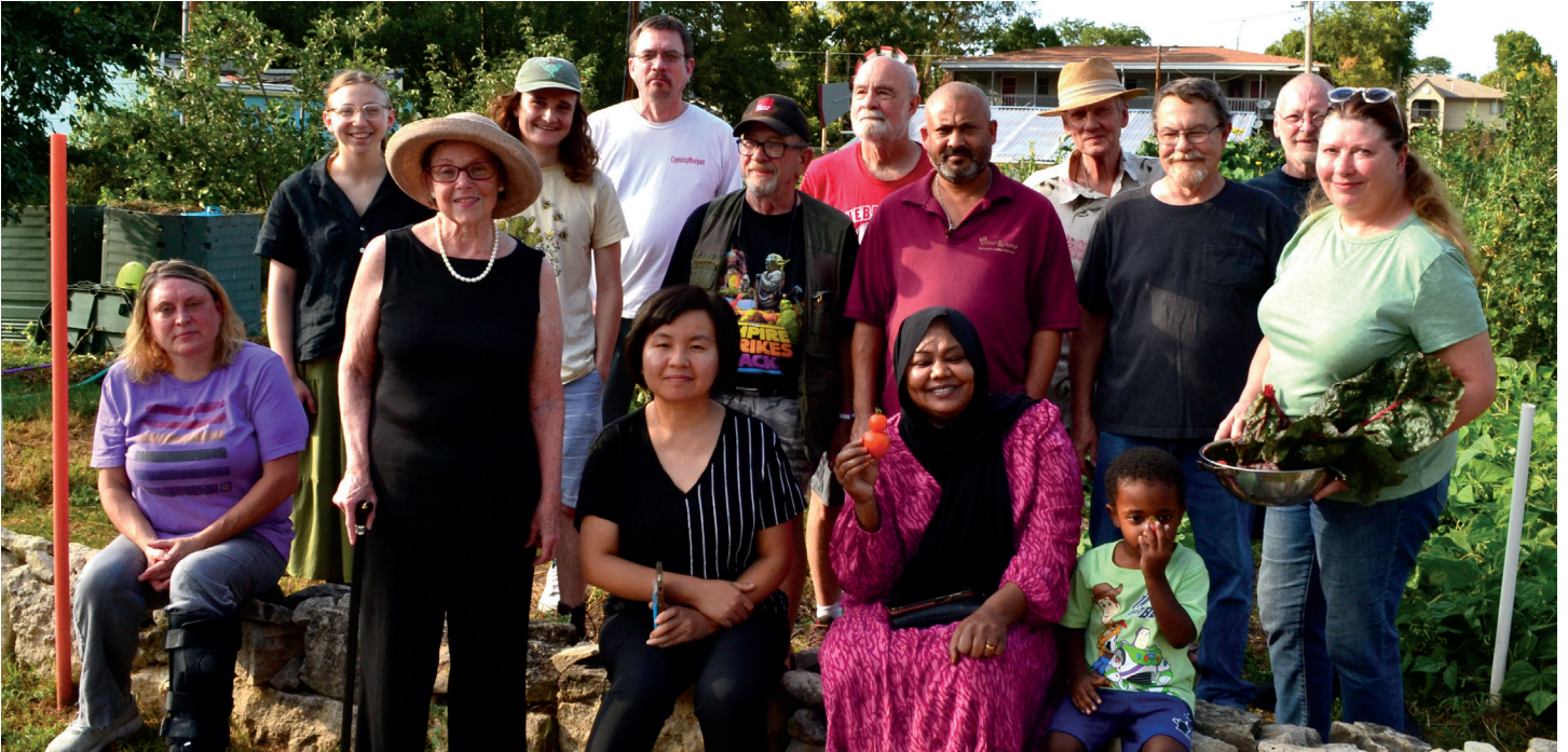
Residents of Hawley Hamlet frequently catch up with one another as they tend to their garden plots.

LINCOLN'S HAWLEY HAMLET IS A HAVEN OF HOME-GROWN FOOD AND COMMUNITY.