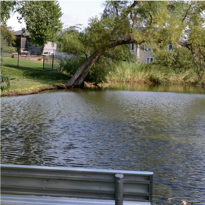
A quiet place to rest and reflect in Lincoln's Vintage Heights neighborhood.

GET INVOLVED WITH YOUR HOMEOWNERS' ASSOCIATION TO MAKE POSITIVE ENVIRONMENTAL CHANGES IN YOUR COMMUNITY.