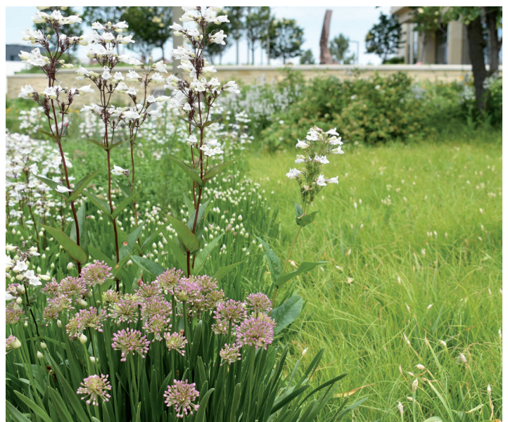
Husker Red penstemon ( Penstemon digitalis 'Husker Red') and ornamental onion ( Allium 'Millenium') are among the many native perennials in Assurity's gardens.