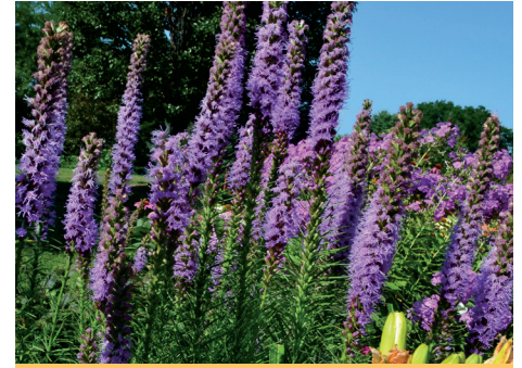
Dense blazing star ( Liatris spicata ) is one of the many native perennials featured in the St. Leo Pollinating Garden.