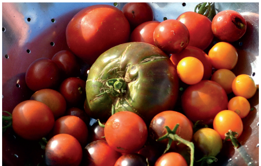
A tomato harvest from one of the resident's garden plots.