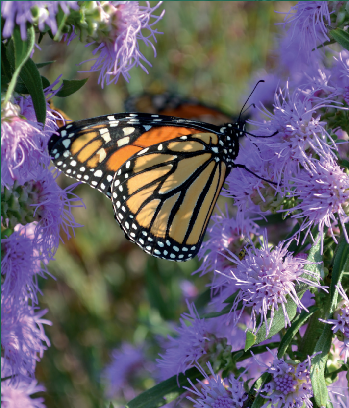
A monarch butterfly feeds on nectar from a meadow blazing star ( Liatris ligulistylis ).