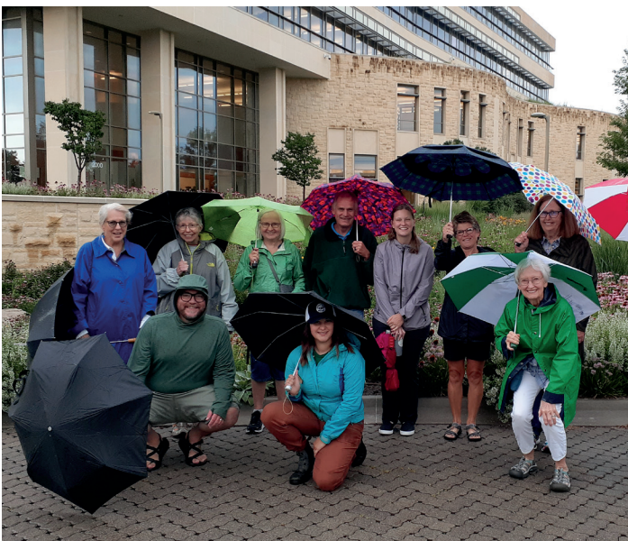
Nebraska Statewide Arboretum members enjoyed a tour of Assurity's gardens as part of Member Appreciation Week in 2023.

A 2023 report in the Harvard Business Review also concluded that experiencing even small doses of nature during the workday could improve performance and productivity by enhancing creativity and increasing mental focus.