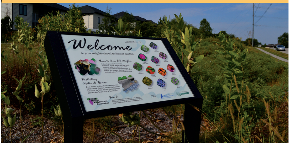
A sign at the entrance to the Vintage Heights pollinator garden explains the ecological benefits to visitors.