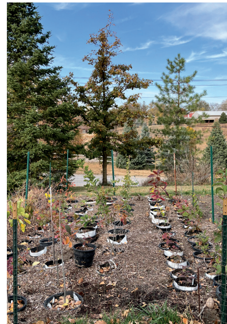
A community tree nursery in West Point.