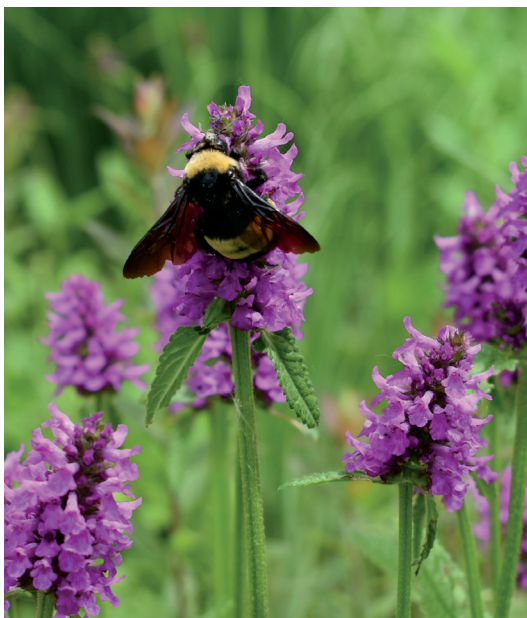
A bumble bee on betony ( Stachys monieri 'Betony').