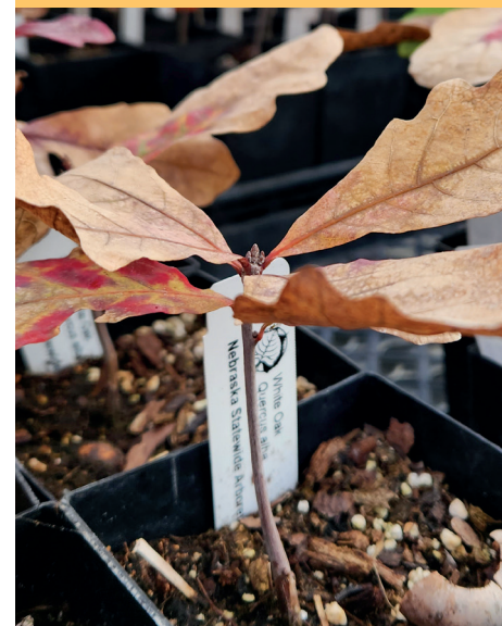
Oak seedlings in the Nebraska Statewide Arboretum's greenhouse.