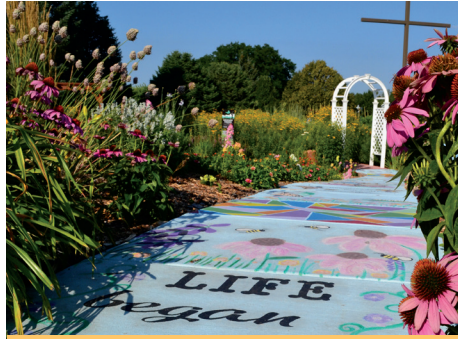
The garden path at St. Leo features hand-painted artwork.

"Think about where you are in the world and who your people are," she advised. "Maybe there is an