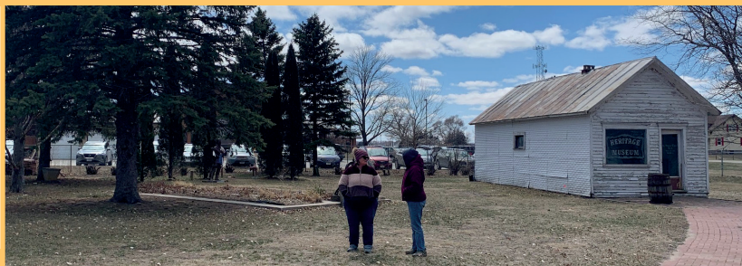
Heritage Park in Battle Creek before the pollinator gardens were installed.

Design is an iterative process, meaning that it can and will change based on feedback or inspiration. Change is also often necessary considering budget limitations, plant availability and site conditions. As such, during a garden design process it is important to maintain an attitude of flexibility and compromise, as this will help to move a project along. However, design revisions should always help support the stated goals of the project.