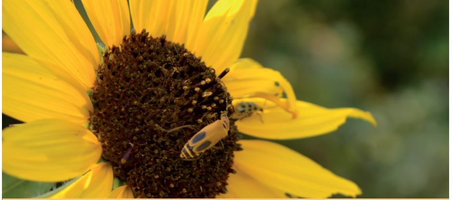
A soldier beetle is one of many pollinators attracted to the sunflowers ( Helianthus spp. ) in the Vintage Heights pollinator garden.