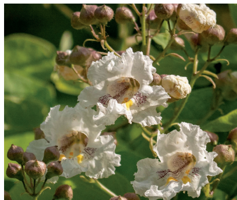
Northern catalpa ( Catalpa speciosa ) blossoms in Suzanne Gates' backyard.