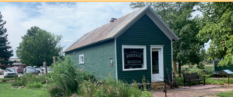
Heritage Park in Battle Creek after the garden was planted.