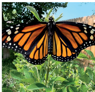
A monarch butterfly in Suzanne Gates' backyard.