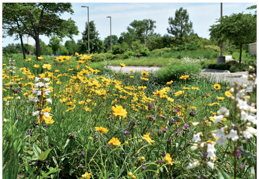
Lanceleaf coreopsis ( Coreopsis lanceolata ) and Husker Red penstemon ( Penstemon digitalis 'Husker Red') add visual interest to Assurity's parking area.