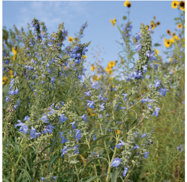
Pitcher sage ( Salvia azurea ) and sunflowers ( Helianthus spp. ) are some of the late-blooming perennials in the Vintage Heights pollinator garden.