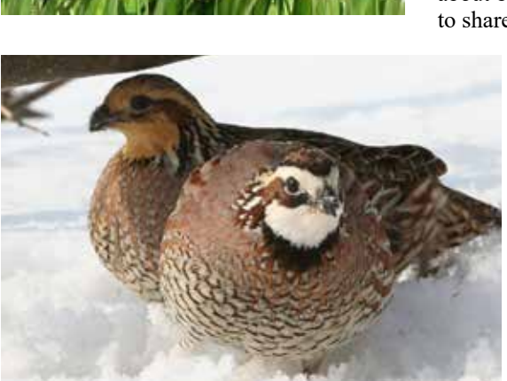
Top to bottom, western meadowlark; bobolink; northern bobwhilte.