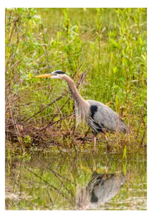
Blue heron

These links can be accessed online at plantnebraska.org/plants/publications