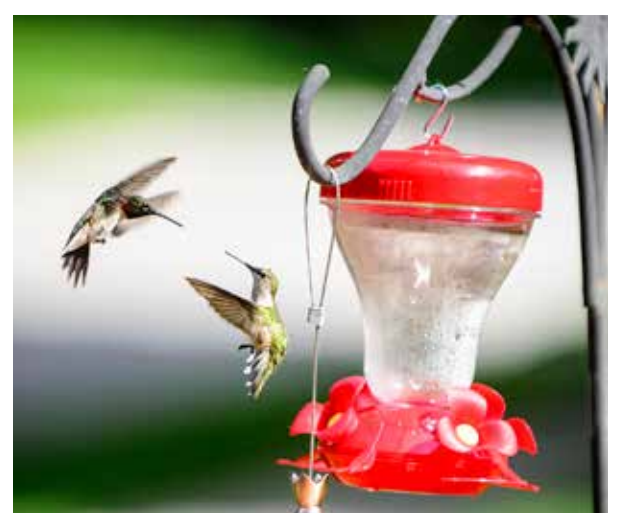
From top, photographybykeller.com: barn swallows; cardinal; eastern bluebird; ruby-throated hummingbirds.

"Birds are indicators of the environment—a sort of environmental litmus paper. If they are in trouble, we know we'll soon be in trouble." Roger Tory Peterson