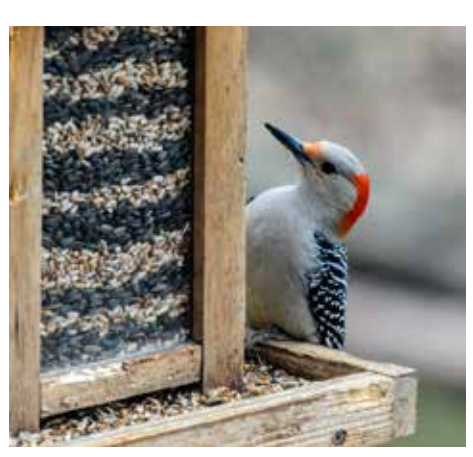
From top, northern flicker; downy woodpecker; yellow warbler; red-bellied woodpecker.