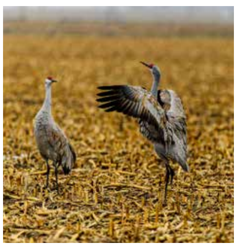
Sandhills cranes, photographybykeller.com