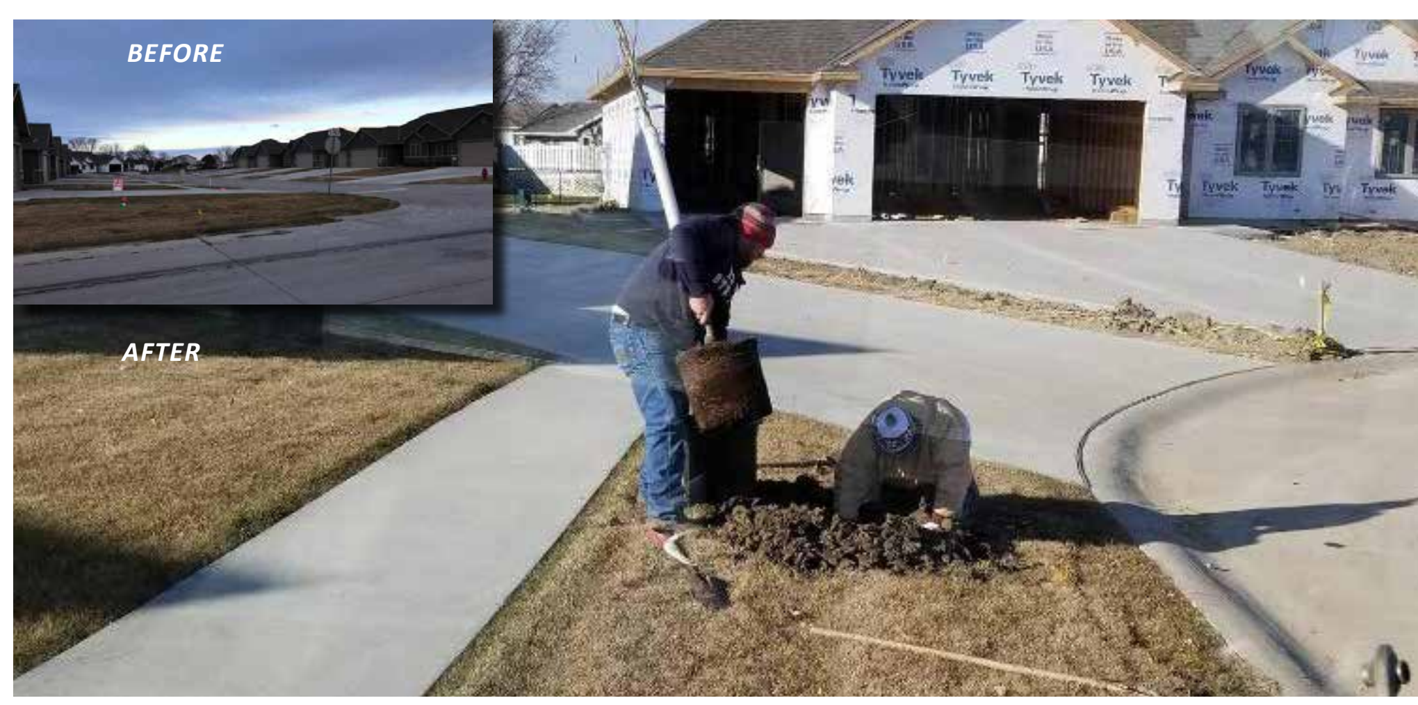
Free trees going in front of new houses in a development.