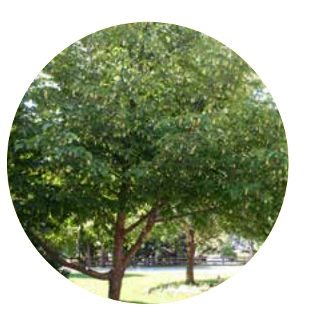
Ironwood Ostrya virginiana