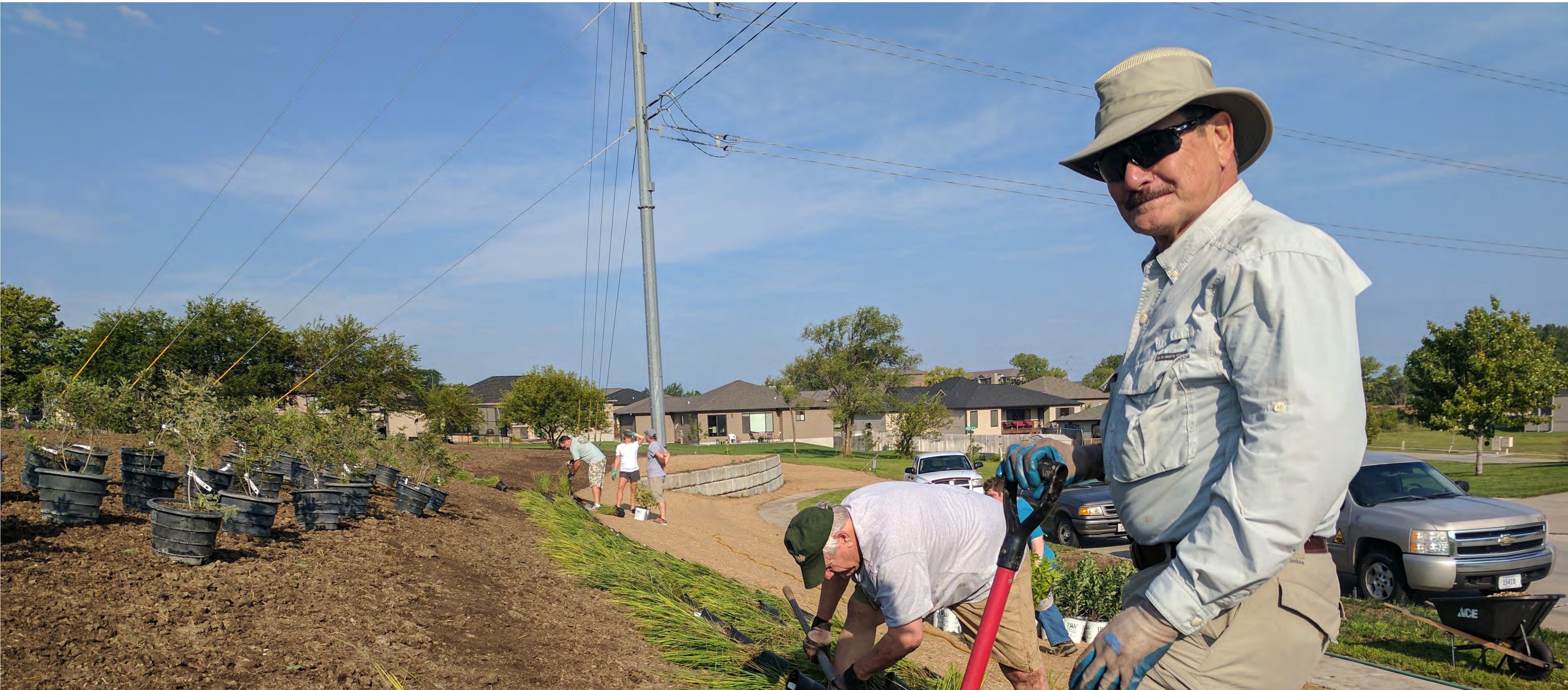
Picture of volunteers during the planting of the project, in August of 2017.

The Vintage Heights Homeowners Association Pollinator Greenway has the following goals: (1) greater water absorption (2) soil erosion prevention (3) creating habitat for pollinators (4) providing a new aesthetic experience in the Commons (5) facilitating educational interest for Lincoln residents. This is a unique site in that it is located under and parallels Lincoln Electric System’s powerline , which requires some restrictions of plants used (no trees or shrubs within 20 feet of the line). The site has considerable slope erosion on the south side which has led to some drainage problems and a build-up of silt off the east end of the greenway.