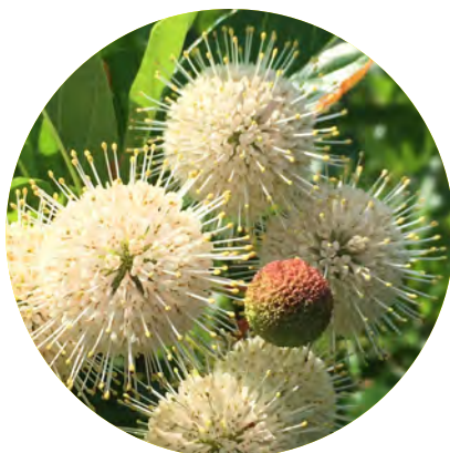
Sugar Shack Buttonbush Cephalanthus occidentalis