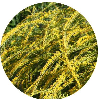
Fireworks Goldenrod Solidago rugosa