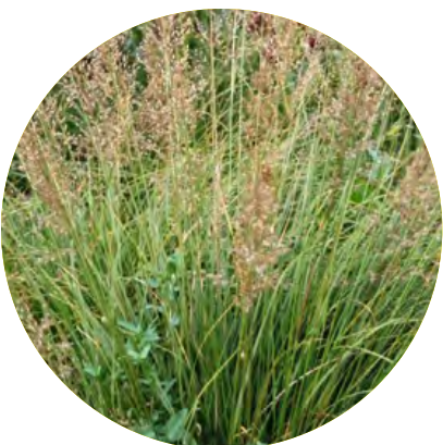
Prairie Dropseed Sporobolus heterolepis