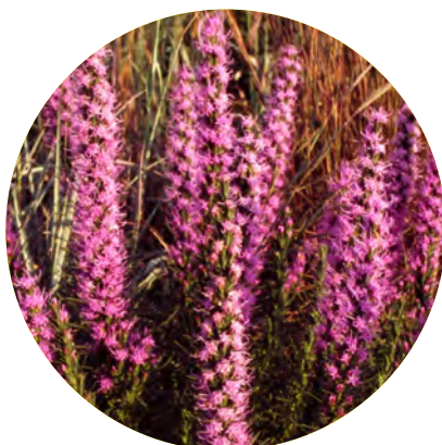
Prairie Blazing Star Liatris punctata