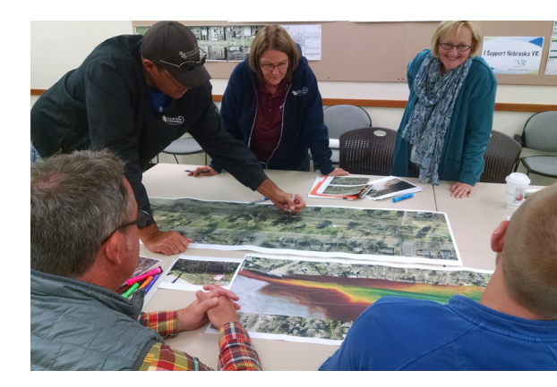
Neighborhood volunteers, city staff and designers collaborating on park improvements.

Nebraska Forest Service staff are available to answer tree and forest health questions and can help you through funding programs for tree-related projects. nfs.unl.edu/foresters