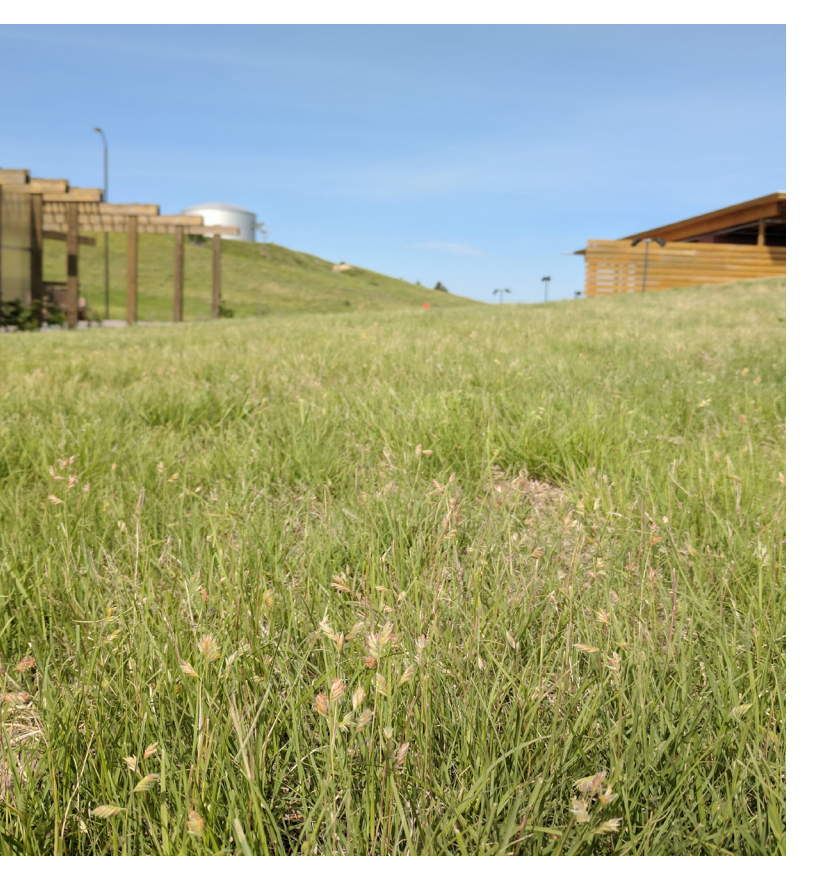
A buffalograss lawn on Chadron State College campus is well adapted to the rainfall of the area.