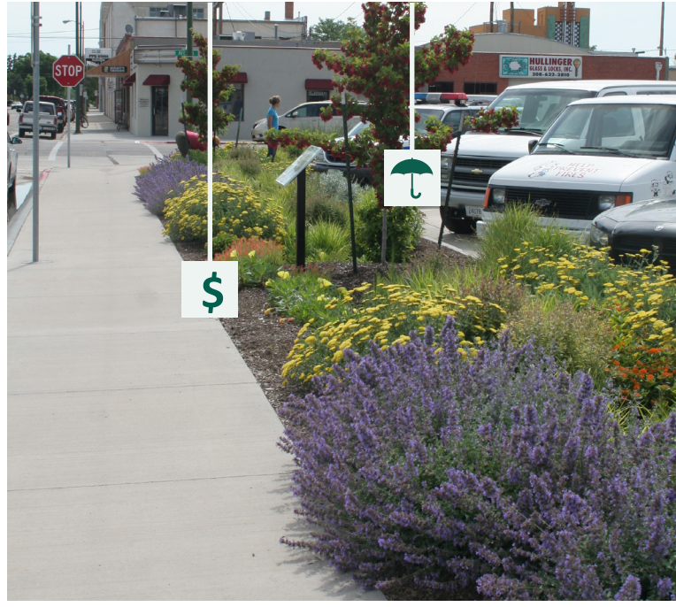
Downtown Scottsbluff has transformed its main street from shades of gray to a people-friendly oasis.