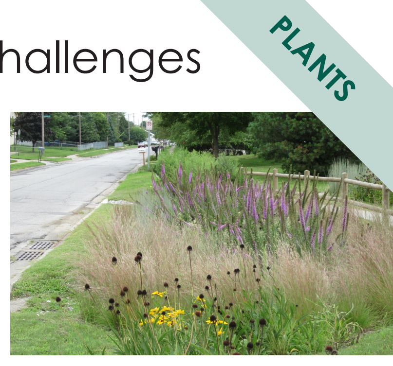
Rain gardens and bioswales, like this one in Omaha, capture and clean water before it enters a stream.

Large, mature trees play an important role in flood prevention by intercepting rain, holding it in their leaves and branches until it evaporates. A single tree can intercept an average of 450 gallons of rainwater per year over a 40-year period [1].