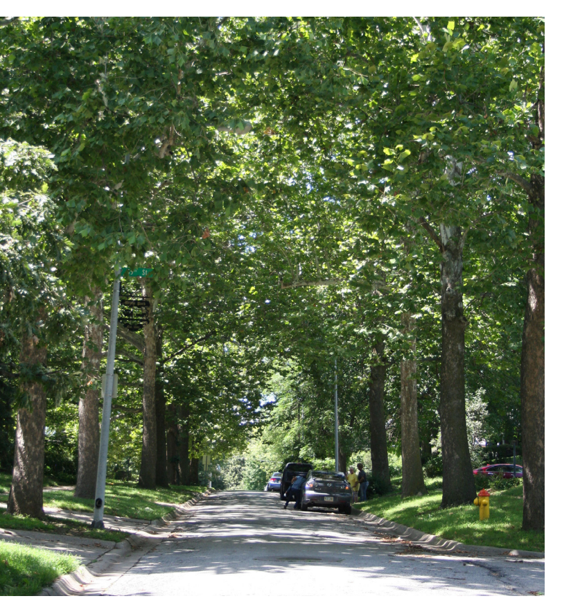
A neighborhood in Omaha enjoys the beauty, quiet and shade their street trees provide.

Landscapes that are planted with native and adaptable species (such as a xeric garden, rain garden, or a buffalograss lawn) are well suited to deal with local pests, climate and soil conditions. They are able to handle extreme weather such as drought, flooding, hot summers and cold winters with less watering, fertilizer and pesticides. Greener Towns plant a diversity of trees and plants in order to benefit from landscapes resilient to pests , disease, changing climates and human pressure.