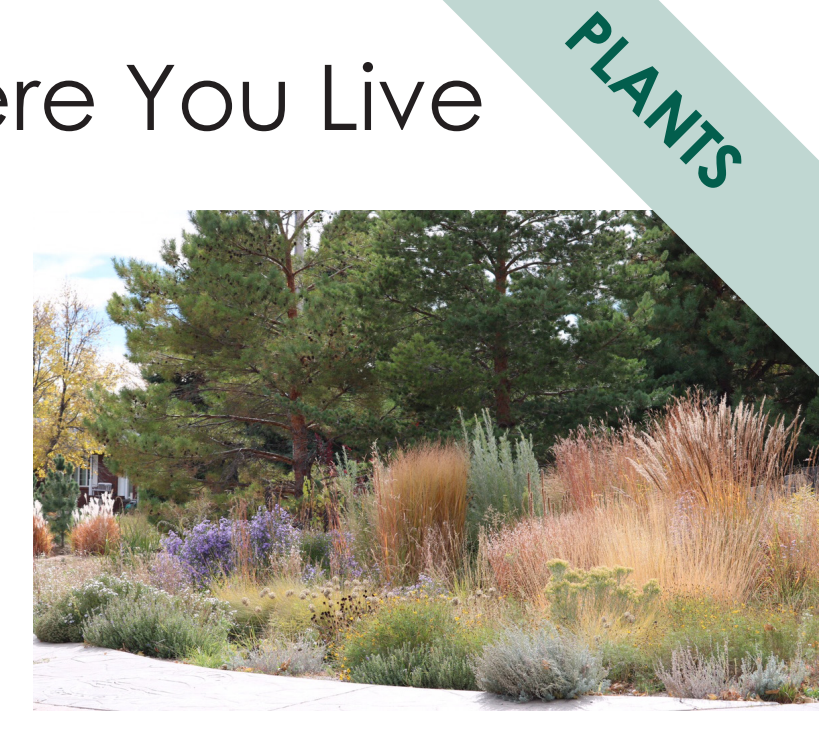
This neighborhood landscape in Gering is full of diverse, resilient and beautiful native plants.