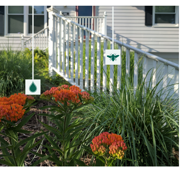
A shift to prairie style gardening gives these home owners a chance to relax.