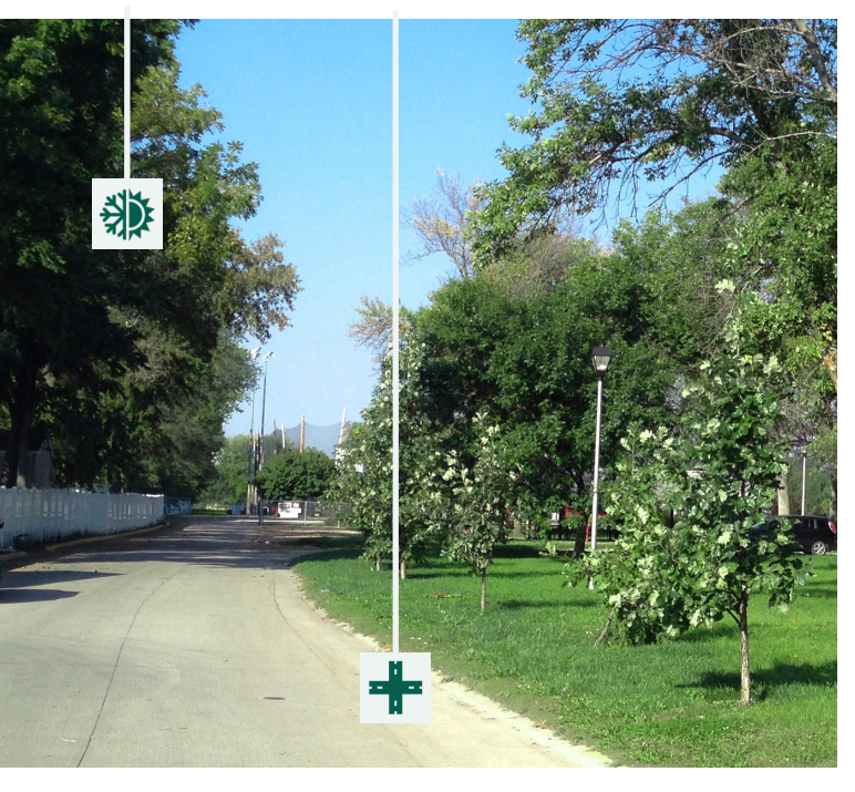
New and mature trees grow side by side to shade streets in South Sioux City.