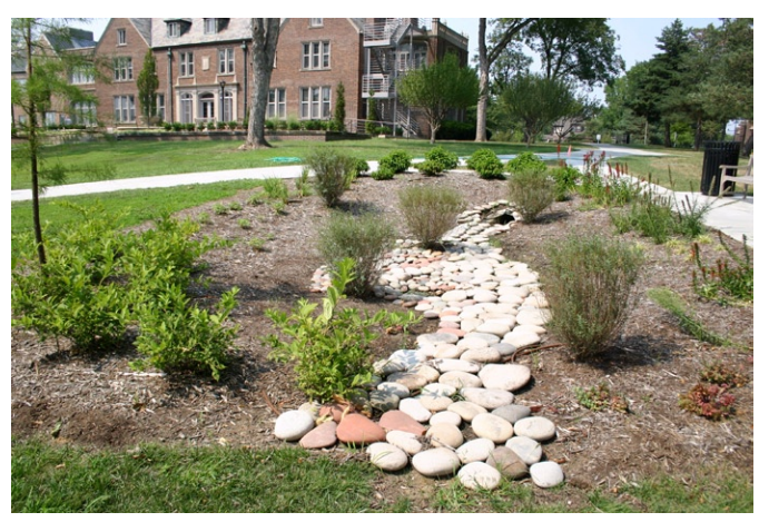
Rain gardens at a church (top) and college campus in Kansas City, Missouri.