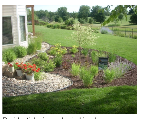
Residential rain garden in Lincoln.

In the first year or two, it's all about the soil. Once plants are established, their root mass will improve water infiltration, but the first several years you have to depend on the soil. Good plant selection is essential in all areas of the garden, as all plants need to tolerate both wet and dry times of the year.