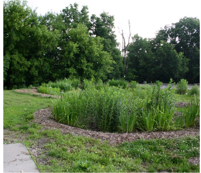
This rain garden absorbs parking lot runoff at the NRCS Service CEnter site in Council Bluffs, lowa.

let spillway that is lower which you can gradually increase the height of over time to increase the depth of water retained after a rain. You may start out with the lip of the spillway only 2-3" high and then, over time as the percolation improves, you build up the height of the spillway with additional soil to create a basin possibly 8-9" deep.