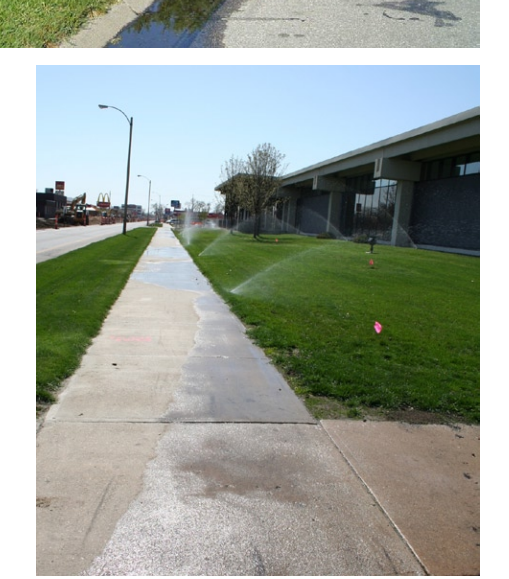
Poor irrigation practices can waste significant amounts of water, especially in areas adjacent to streets and sidewalks.

Thankfully, many people are now seeking ways to live "greener" lives and to help better the natural environment.