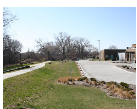
Top: Landscape design for Fireworks. Middle: This parking drain will be plugged to divert storm water to the rain garden.

Bottom: A rain garden is proposed for the drainage-way on the east side of the property, adjacent to a public bike path. (Plan and photos courtesy Justin Evertson)