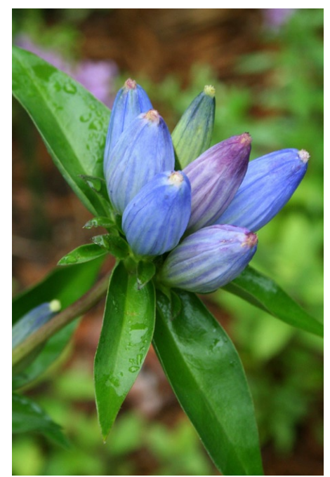
Calamagrostis brachytricha, Korean feather reedgrass

'Zebrinus'-bright yellow bands on foliage