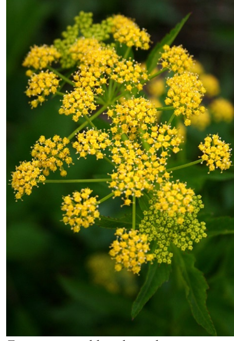
Zizia aurea, golden alexander

Zizia aurea, golden alexander2-3' h, 18" w. Brilliant yellow umbrella-like flower clusters in April-May are reminiscent of dill or parsley flowers; dark green foliage remains blemish-free all season; sun to part shade; food and nectar source for butterflies.