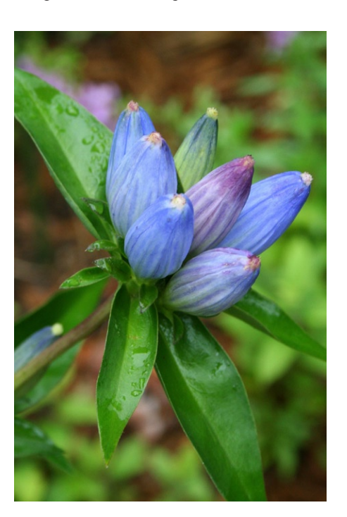
*Gentiana andrewsii, bottle gentian *Helenium autumnale, Helen's flower *Iris virginica shrevei, blue flag iris *Liatris pycnostachya, thickspike gayfeather *Liatris spicata, marsh gayfeather *Lobelia siphilitica, great blue lobelia *Solidago riddellii, Riddell's goldenrod

*Eupatorium maculatum, Joe-Pye plant *Filipendula ulmaria, queen of the meadow