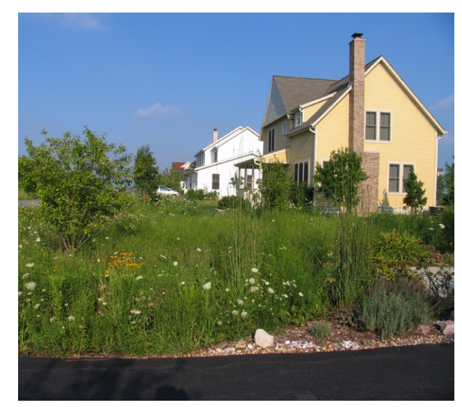
Rain garden at Iowa School for the Deaf in Council Bluffs, Iowa.

Sustainable landscape at Omaha's National Park Service headquarters.