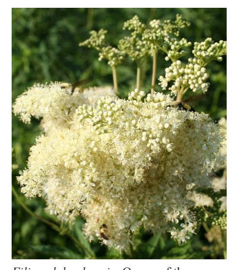
Filipendula ulmaria, Queen of the Meadow 3-5'h, 2'w. Elegant plant with creamy white, astilbe-like flowers blooming in early summer atop a clump of dark green serrated leaves; ideal companion with beebalm; full to part sun.

Filipendula rubra, Queen of the Prairie 4-5' h, 2' w. One of the best wet soil plants with large pink plumes atop upright stems and a basal clump of handsome dark green, serrated leaves; sweet cotton candy scent; very easy-to-grow.