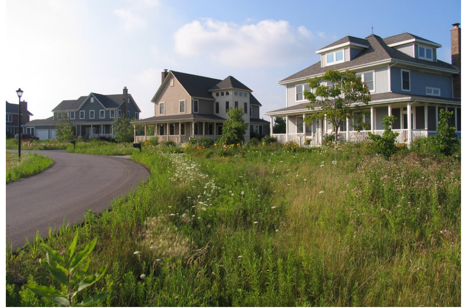
Drainage swale and naturalistic front yard landscape in residential development near Chicago.

Water and the Landscape continued on page 7