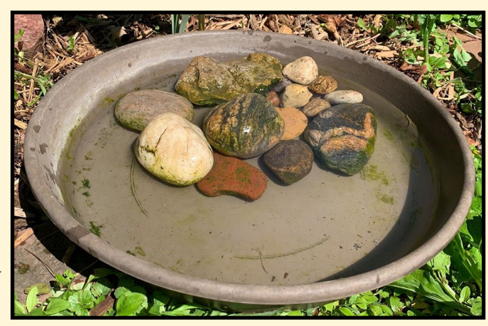
A perfect example of a water source for pollinators

All living creatures need water. When creating a bee friendly habitat, consider including a small replenishable source of water for bees to drink. We recommend a shallow one-foot diameter dish that has wet sand or pebbles placed in it. The water should not cover the pebbles or sand to prevent the drowning of bees. Be aware that mosquitoes lay their eggs in shallow, standing water. Therefore, check your bee water source every few days for small, "wiggler" mosquito larvae. Remove any mosquito larvae by emptying the water dish, and quickly wiping down the surfaces of the bowl with a towel.