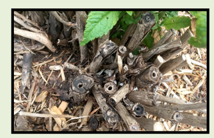
Notice the tiny holes in each of the plant stems