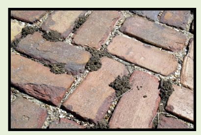
Halictus rubicundus nests between bricks, UNL East Campus