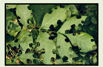
Leafcutter bees have cut circular pieces out of the leaves of this rose.

The majority (over 70%) of all bees nest in the ground. As most of these bees are also solitary, there is often only one nest (with a single mother located in an area). However, if habitat conditions are ideal (e.g. soil type, soil texture, sun exposure, moisture), you may see multiple bees of the same species nesting in close proximity to each other. These individual mother bees provision and lay eggs independently of each other and do not share in raising each others' young or participate in communal defense (this is very similar to apartment living in humans). To provide habitat for wild ground nesting bees, leave bare patches of soil of various types in your landscape.